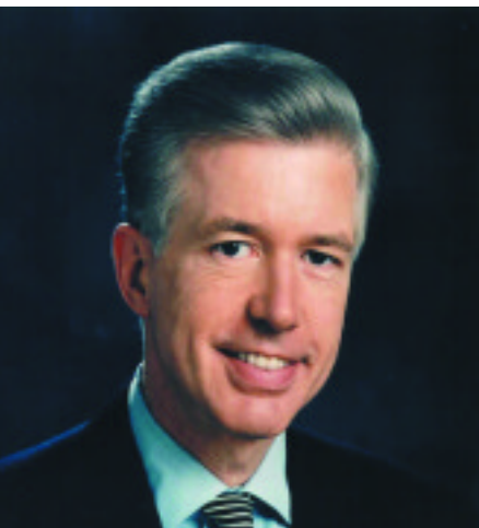
Governor Gray Davis

In terms of creativity, California leads the world—in entertainment, technology and Olympic sports. As the engine of America's pop culture, its influence reaches the far corners of the earth. California's film, television and music industry generated more than $30 billion in revenues last year. More than half of all U.S. multimedia companies are clustered around Los Angeles and San Francisco. One out of every five computer software jobs is located in California. The future's most powerful emerging technologies are here: half of all biotech workers—and one-third of all biotech companies—are found in California.