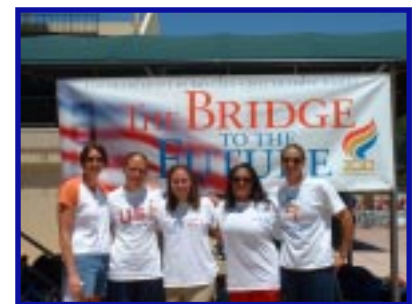
2002 Holiday Cup Team members

While most families celebrated the day of our nation's independence with barbeques and firework displays, sports fans and water polo lovers headed out to Stanford University to catch a glimpse of intense international women's water polo competition. July 4th kicked off the first games of the Holiday Cup tournament including